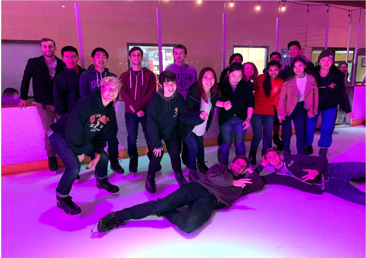
Pictured: Actuaries on Ice! January 26, 2019.